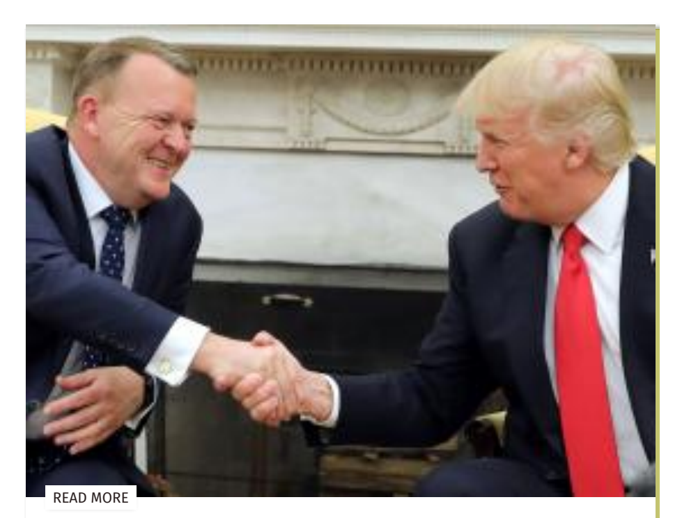
Denmark to give £37m to women's charities affected by Trump

"This study shows that making health care services available does not automatically make them accessible or acceptable. To close the health care gap for the most vulnerable and marginalised, we need to find innovative ways to bring services to people where they are," she said.