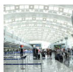
ZIKA ALERT: COSTA RICA INCREASES