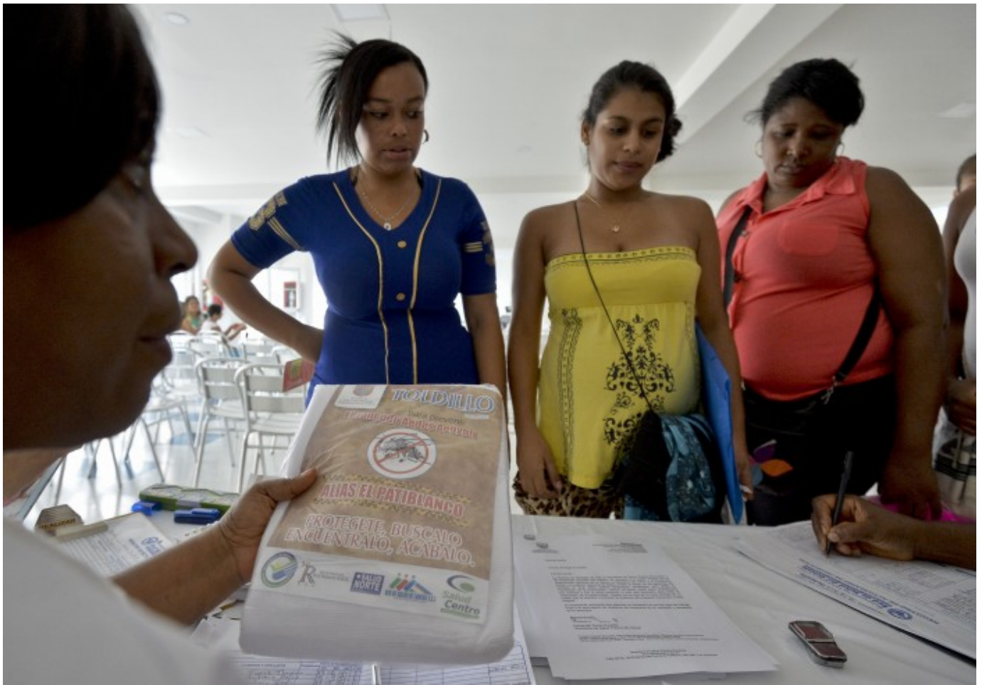
Health workers hand out mosquito nets to pregnant women in Calí, Colombia, to fight the Zika virus.

Other women said they felt the Zika virus closing in on them like a mosquito in a closed room, and thought it was only a matter of time until they — and their unborn children — were affected by the virus.