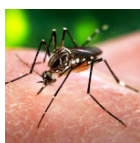
FIRST ZIKA VIRUS CASE REPORTED IN