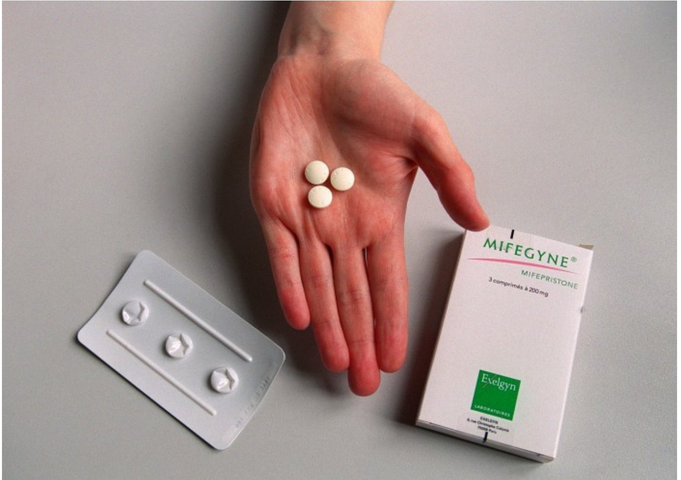
The RU-486 pill, or Mifepristone.

“Probably a lot of women are looking for abortion services now. Women that are pregnant and suspect that they have had Zika and they just don’t want to take the risks of having a microcephalic baby,” she said. “Our worry is that these women will turn to unsafe abortion methods, while we can help them with a safe, medical abortion.”