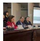
COSTA RICAN PLAINTIFFS DISAPPOINTED,