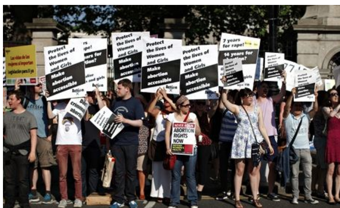
Pro-choice supporters hold placards in front of the Irish parliament building in Dublin.