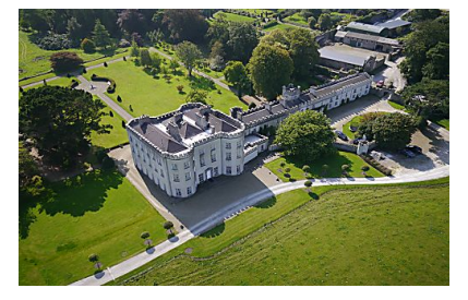
Six Castles for Sale Mansion Global