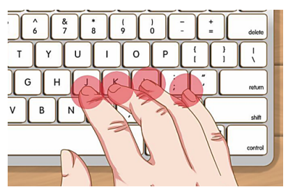
Don't Forget To Do This Every Time You Turn On Your PC...