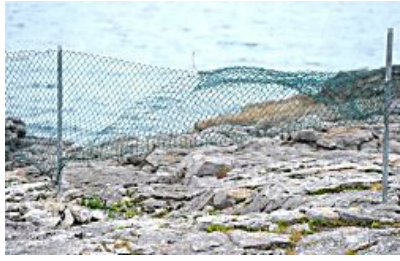
Landowners at beauty spot ordered to remove fencing