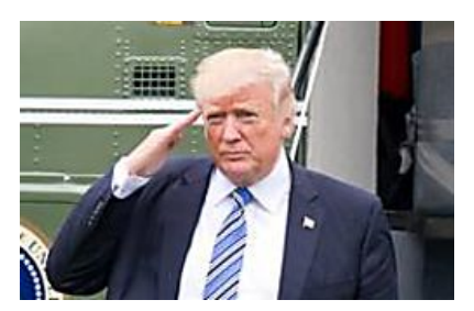
Donald Trump 'considers firing top White House staff, including Sean...