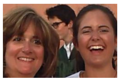
Mother dies saving daughter's life in car crash on Mother's Day Independent.ie