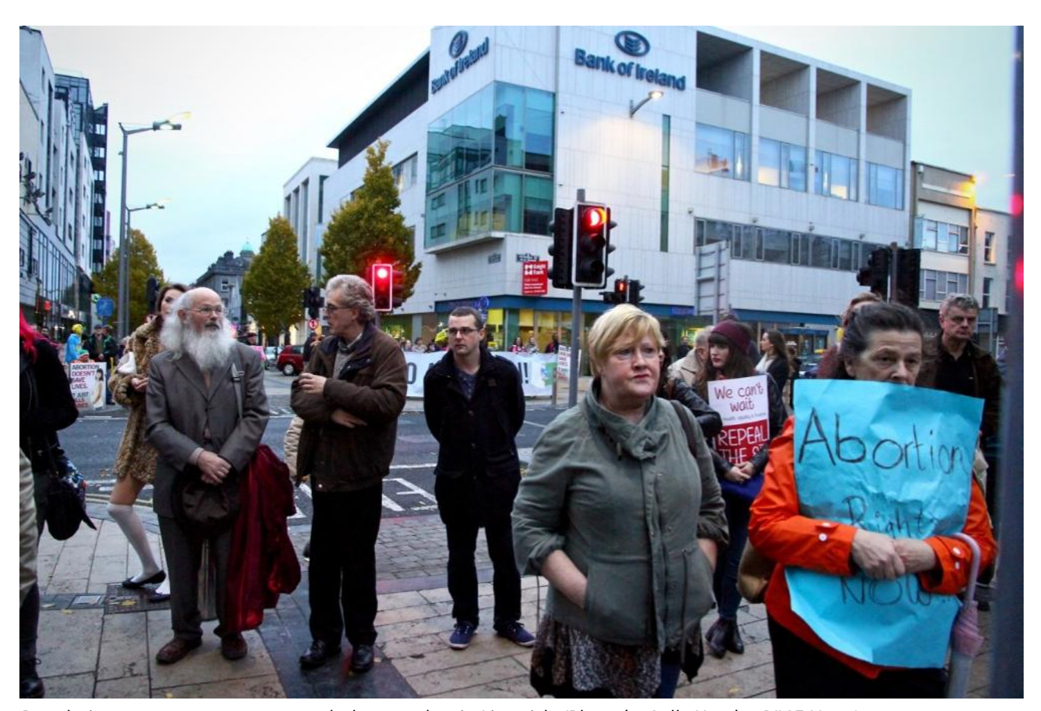
Pro-choice supporters come to watch the speeches in Limerick.

Coppinger later noted that no one of child-bearing age in Ireland has ever voted on whether abortion should be illegal — the last full (http://www.thejournal.ie/abortion-referendum-1983-what-happened-1225430-Dec2013/) referendum being 32 years ago.