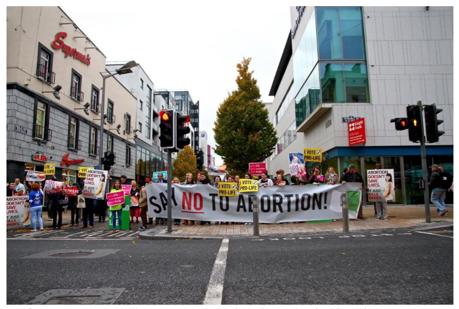
Pro-life campaigners on O'Connell Street in Limerick, Ireland's southwest.

To safeguard against this, Gomperts said she always advises women that there should be somebody with them when they take the pills.