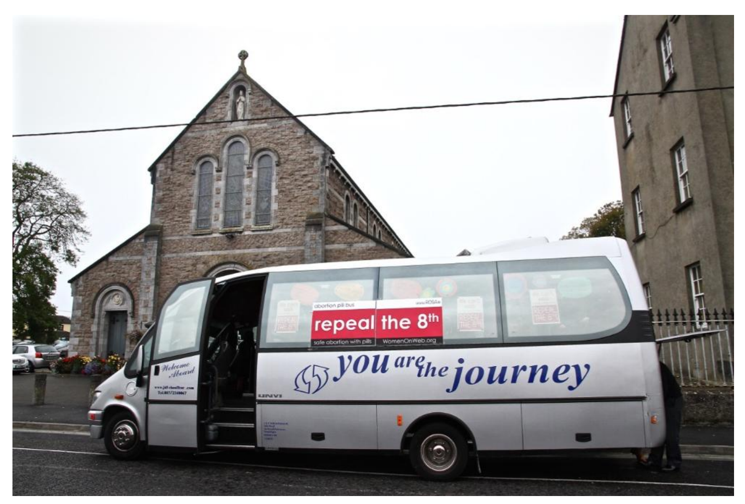
The "abortion pill bus" parked in front of Galway's St. Mary's on the Hill church.

For the law to be changed, a referendum is required — something both the United Nations (http://www.independent.ie/irish-news/health/un-says-ireland-should-hold-a-referendum-on-restrictive-abortion-law-31322360.html) and human rights group Amnesty International (https://www.amnesty.ie/sheisnotacriminal) have called for over the past year.