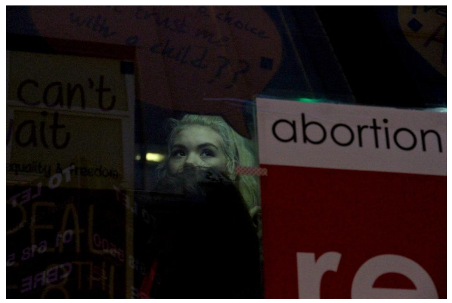
A 17-year-old campaigner looks out at Limerick while on board the bus.

The turnout in Limerick's O'Connell street was much larger than Galway, with a noticeably more vociferous group of pro-life activists on one side of the road, while the pro-choicers had a substantial audio system on the other.