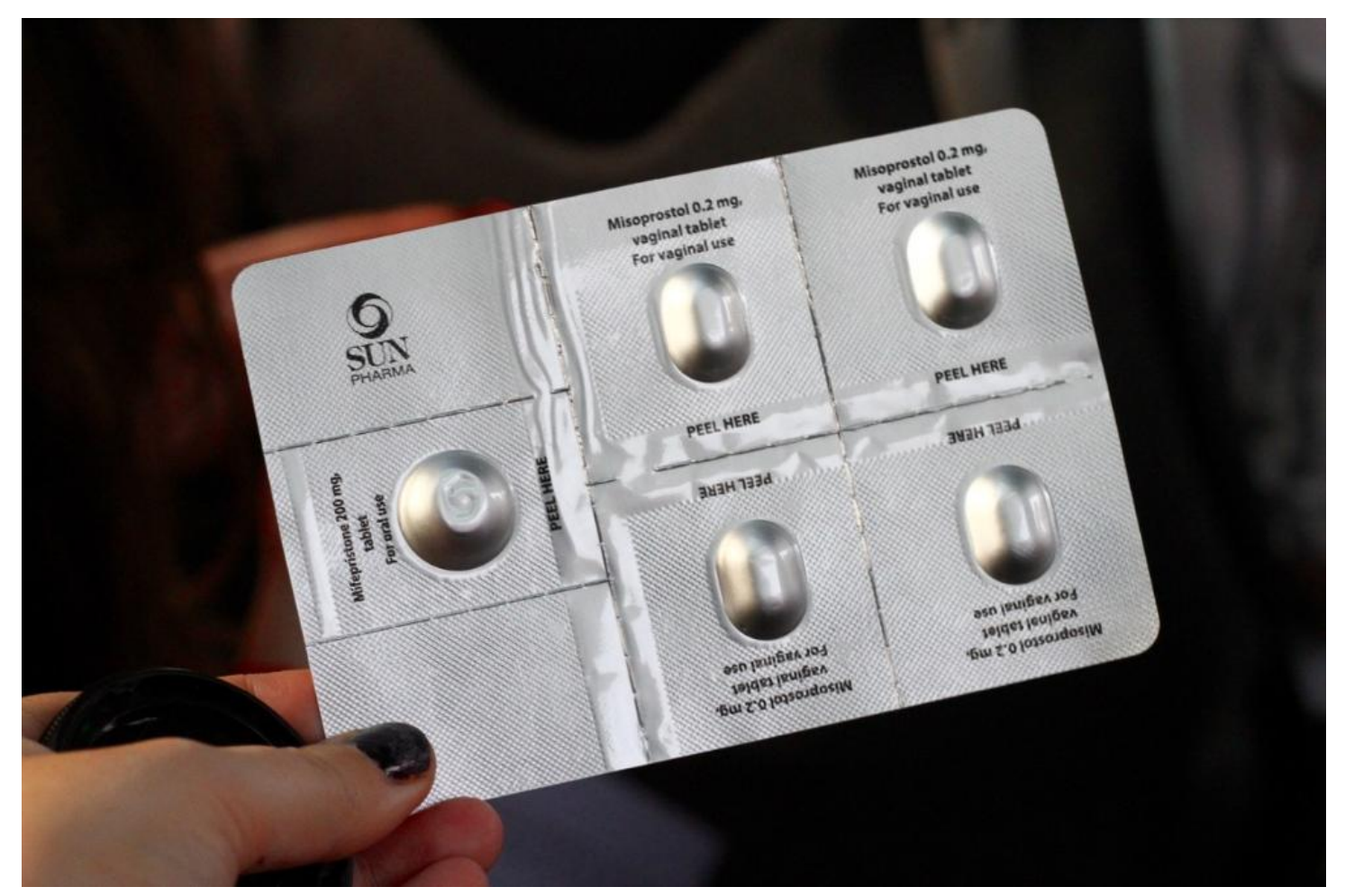
One of the packets of mifepristone and misoprostol on board the "abortion pill bus."

There's been some skepticism about whether there are actually pills on board the vehicle, but VICE News can confirm that at the outset of the journey there were at least 10 packets of mifepristone (http://www.drugs.com/cdi/mifepristone.html) and misoprostol (http://www.drugs.com/cdi/misoprostol.html). VICE News can also confirm that at least one woman who boarded the bus procured pills for personal and imminent use.