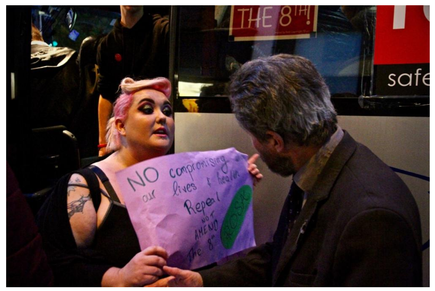
A pro-choice activist argues with a pro-life activist in Limerick.