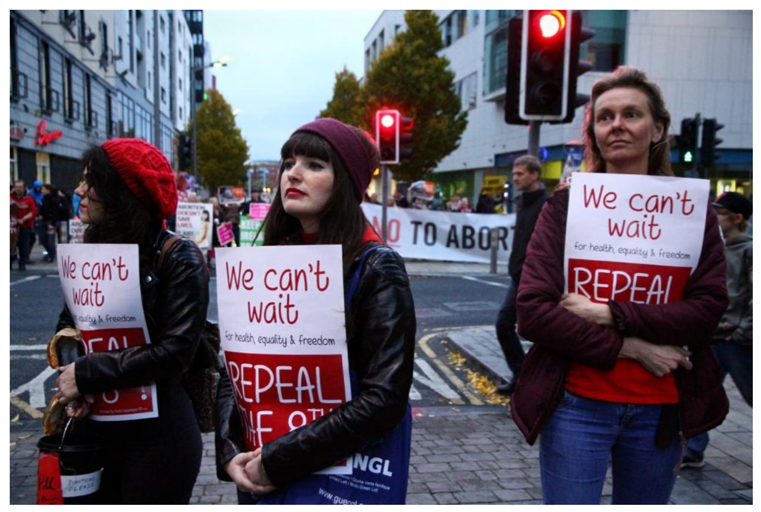
ROSA campaigners watch speeches on Limerick's O'Connell Street.

A few dozen supporters had turned up to greet the bus, as had some protesters.