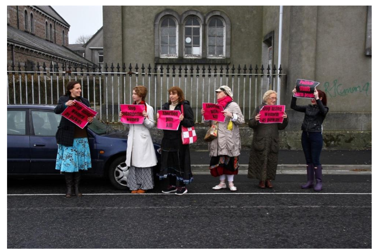
Pro-life campaigners beside the "abortion pill bus" on Claddagh Road in Galway.

However, those who can't travel include young people in the care of the state, migrants without valid visas, and women without the financial resources — activists estimate the cost of travelling comes to 1,500 euros ($1,652).