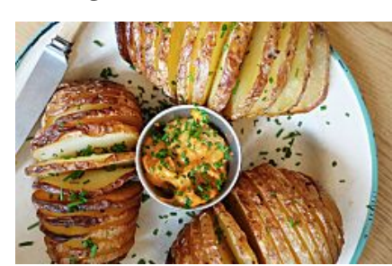
Hasselback Potatoes met Smoked Chilli Mayo Gran Luchito