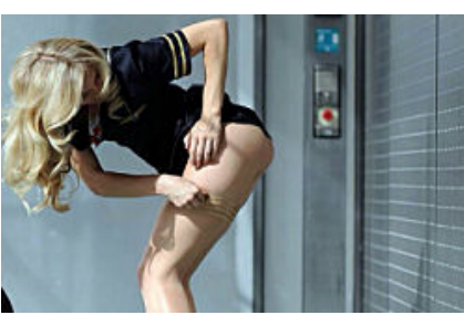
This Will Make Your Flight A Lot Better Wandering Pioneer