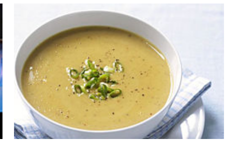
10 Simple & Delicious recipes for under $5 that may boost your health... Snook Shack