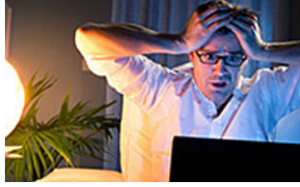
7 Redenen waarom je gek bent als je loterij loten in de winkel koopt The Lotter